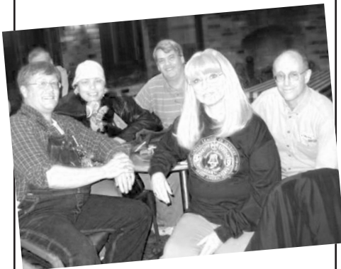
The winning team.